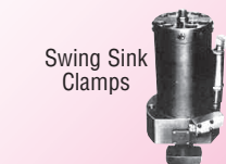
Swing Sink Clamps